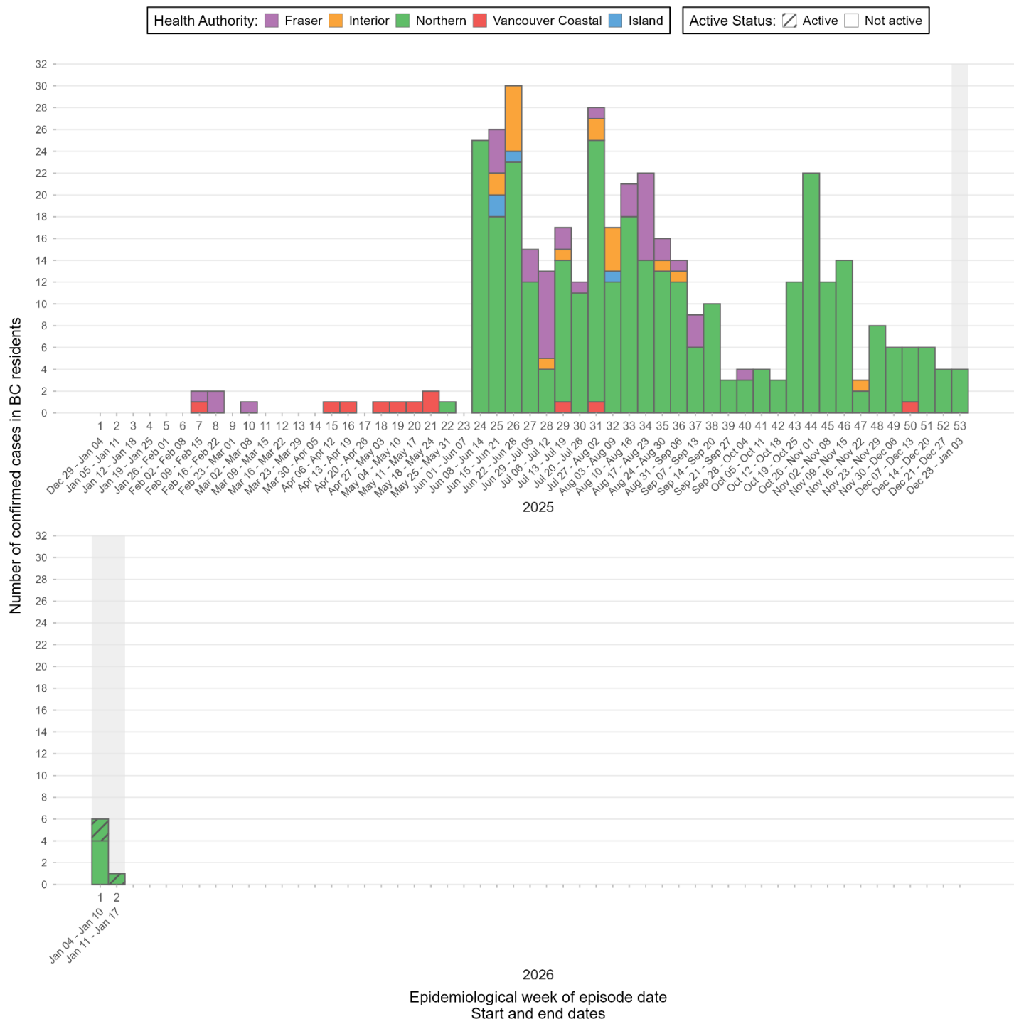
Figure 1. Epidemic curve of confirmed measles cases reported in BC by RHA and active status, 2025 and 2026

Total count = 406 cases reported in British Columbia.