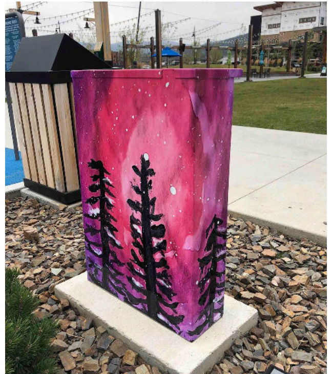
Gavin Wanders of Belgrade & Lily Hoeksema - Big Sky, Montana.