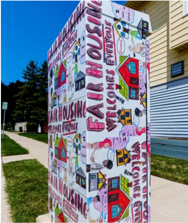
Artist unknown - West Allis, Milwaukee